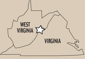
"Scenic Roads in Virginia"